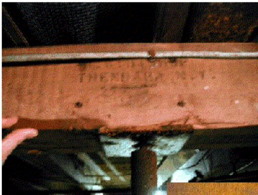
Stamped Floor Joist Above

The cottage basement & attic markings identify the Mail-Order kit home with Ralph Bishop's name, and the location of the delivery to Thendara, NY.