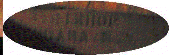
Stamped Attic Rafter